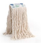
Ecolabel mop wide central band