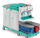
Magic System 820E