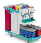
Magic System 810S