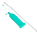
Magic BCS pedal set