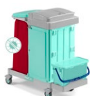
Magic BCS 750S