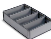
Divider Magic Hotel