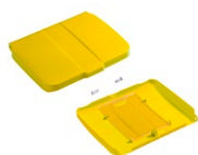
Lid 120 L bag holder with check-list holder