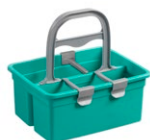
Bottle rack with ergonomic handle and 3 removable dividers