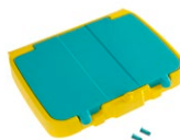
Double bottom lid for 120 L bag holder