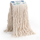
Ecolabel mop wide central band