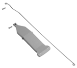
Pedal set for Magic bag holder