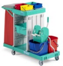
Magic Line 350B