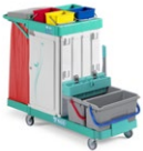
Magic Line 350S7