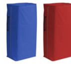
120 L plastified bag with zip