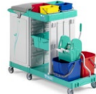
Magic Line 350P