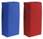
120 L plastified bag