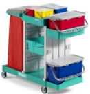
Magic System 720B