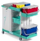
Magic System 720P