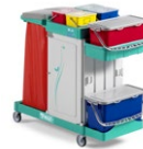
Magic System 720S