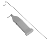
Pedal set for Magic bag holder